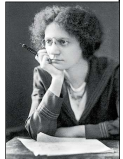
Mary Antin in 1915

In Europe, a young Jewish child's religious education was a normal part of growing up. It usually revolved around the one-room school, the cheder , where the teacher, the melammed , taught the basics of the prayer book and the Bible by rote and by threat. The cheder was not successfully transplanted to America. The focus of American Jews was on the public-school education of their children. Since the majority lived in communities with high Jewish populations, reminders of their religious and ethnic culture constantly surrounded them. Chelsea was no different. We got our challah on Central Avenue